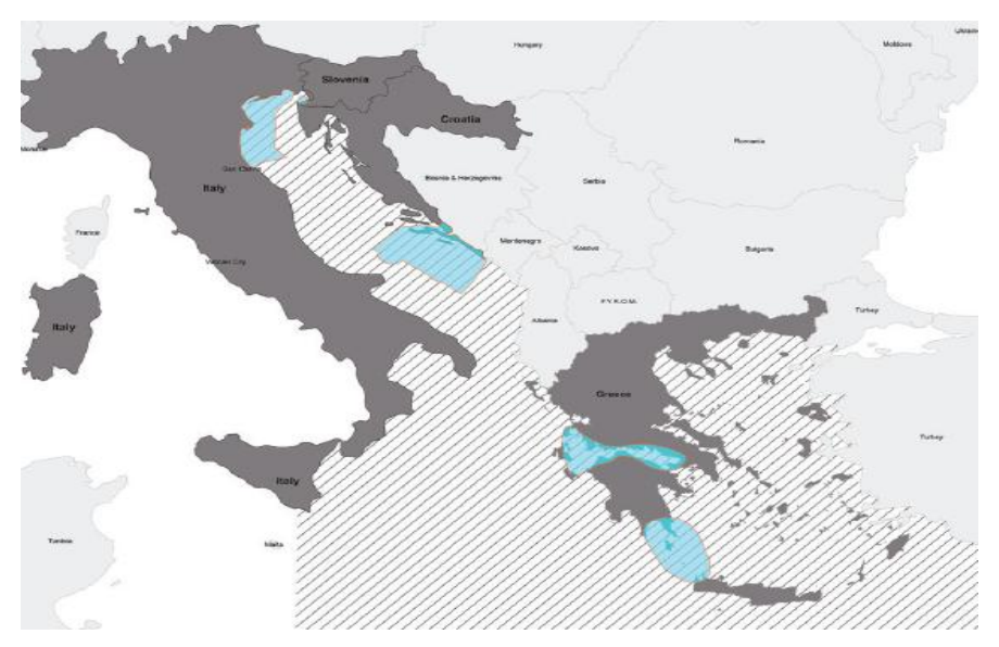
Figure 2: The SUPREME Case Study areas